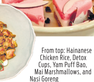
From top: Hainanese Chicken Rice, Detox Cups, Yam Puff Bao, Mai Marshmallows, and Nasi Goreng

for us. Considered a, if not the, national dish of Malaysia, Nasi Lemak is a flirtation of rice, coconut milk, tender marinated chicken and spices, cooked in pandan leaves. Needless to say, we fell in love.