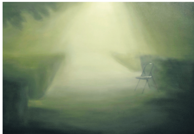
Nox Umbra-Night Shadows by Divya Singh's, oil on canvas

The minute structural similarities between our lived realities and the nature of the universe as both separate and intertwined dimensions have