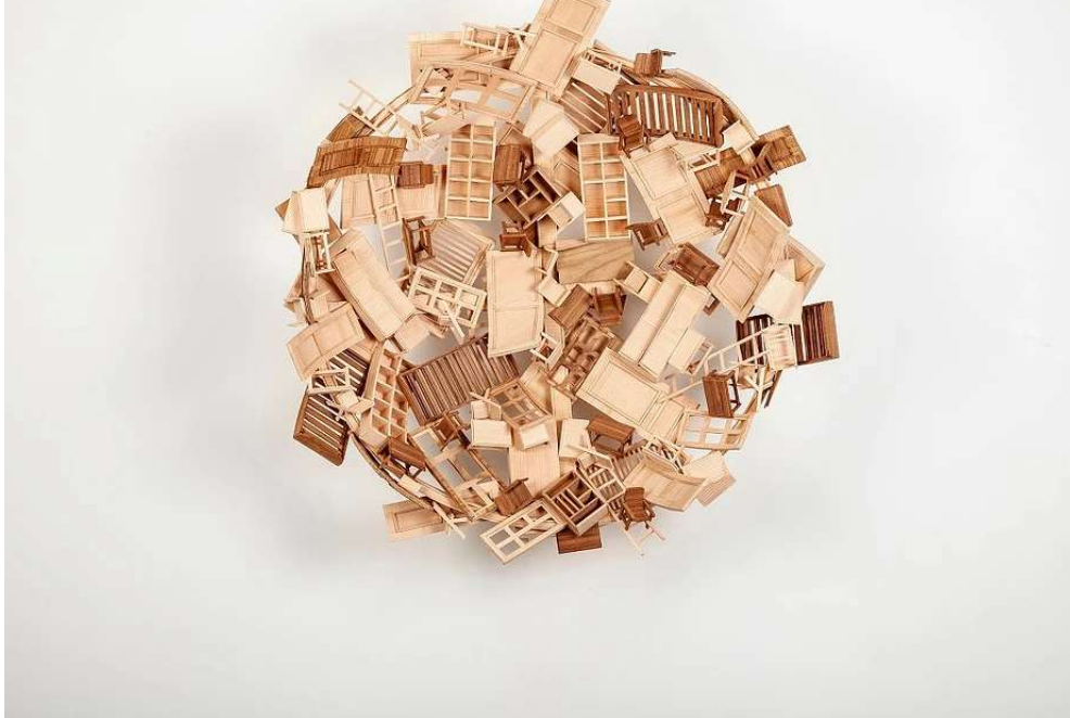
Martand Khosla, No Reason to Care (2020).

The smoothing transitions on your screen would be nothing short of a seamless experience that arranged works of art in a fluid structure. What you would witness in this room was how individual works were stitched into a common trail of thought that catered to the naked eye.