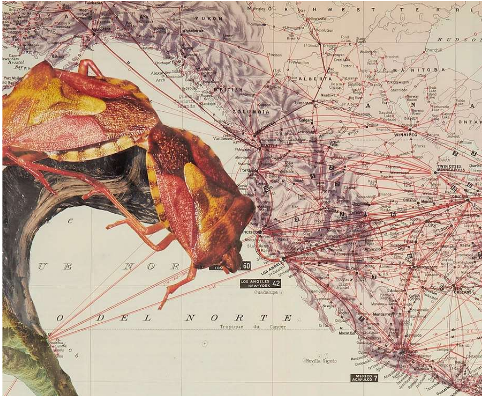
Apnavi Makanji, Detail of Appropriation Disinformation - Nature and the Body Politic (2019).

Apnavi Makanji's "Appropriation Disinformation - Nature and the Body Politic". It turned to a different stretch of a map to elaborate on the collision and spirit of nature and the body politic. With maps from Atlas International Larousse Politique et Economique (1950), Makanji's collection of treasures was also a glimpse into how this stop could be anywhere on the map and you could visit it just the same.